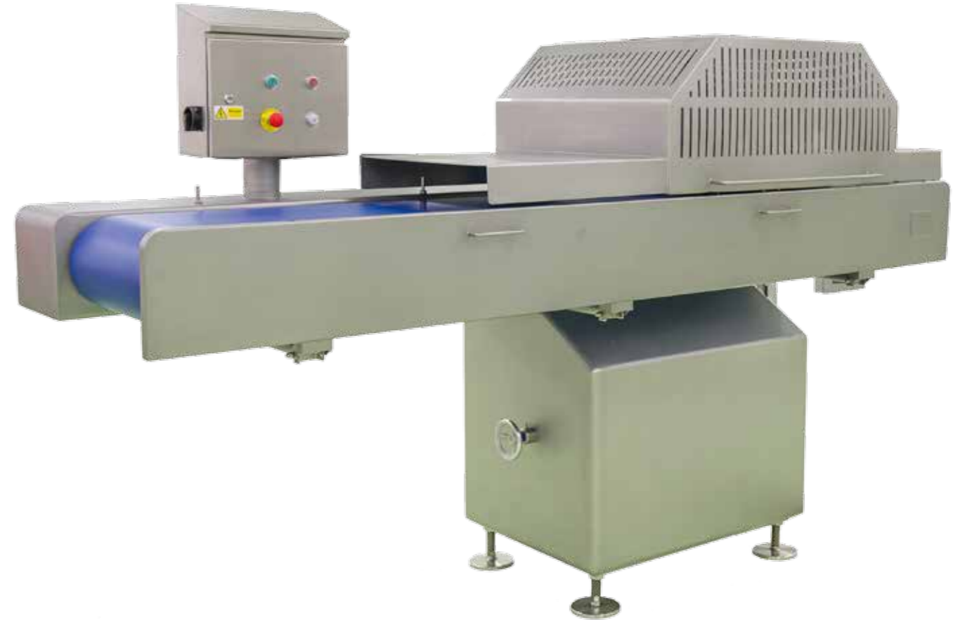
Very Robust and Hygienic Guillotine Dicer for Delicate Products